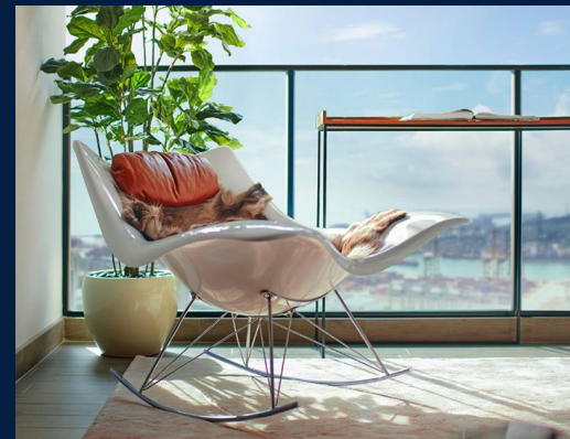
3 - Bedroom Premium Classic